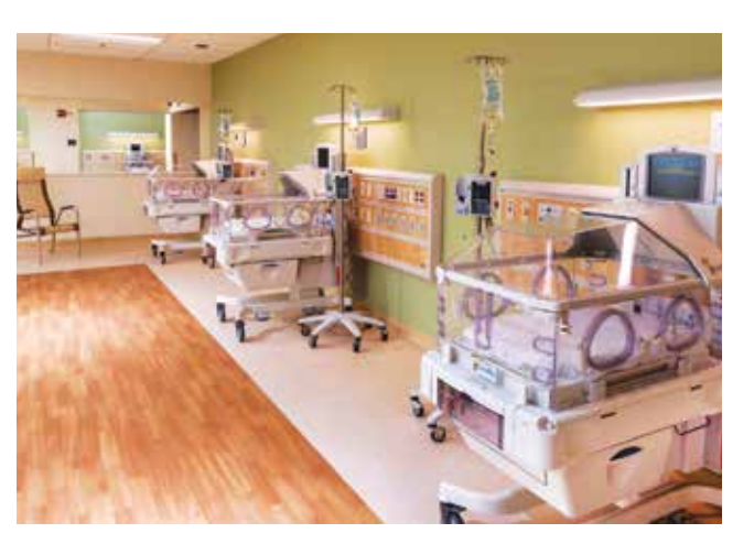
HIGH-TECH NICU CRIBETTES ensure that babies sleep soundly in our NICU.