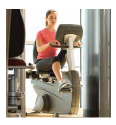
RECUMBENT BIKE provides our cardiac rehab patients a comfortable ride during physical therapy and rehabilitation.